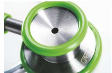
Adult - Ø 45mm Ref. S20010