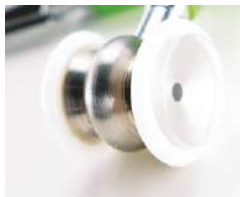
New born - Ø 17mm Ref. S20019