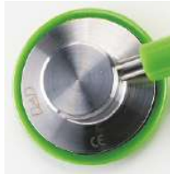
Pediatric - Ø 34mm Ref. S20032