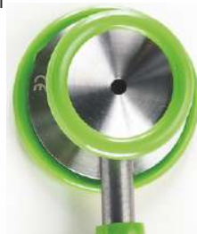
Pediatric - Ø 34mm Ref. S20011