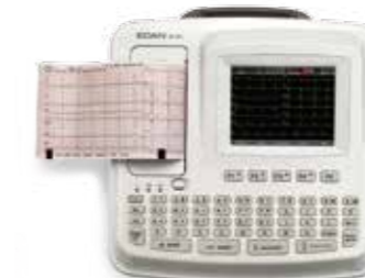
SE-601B (5.6" Color LCD Display)